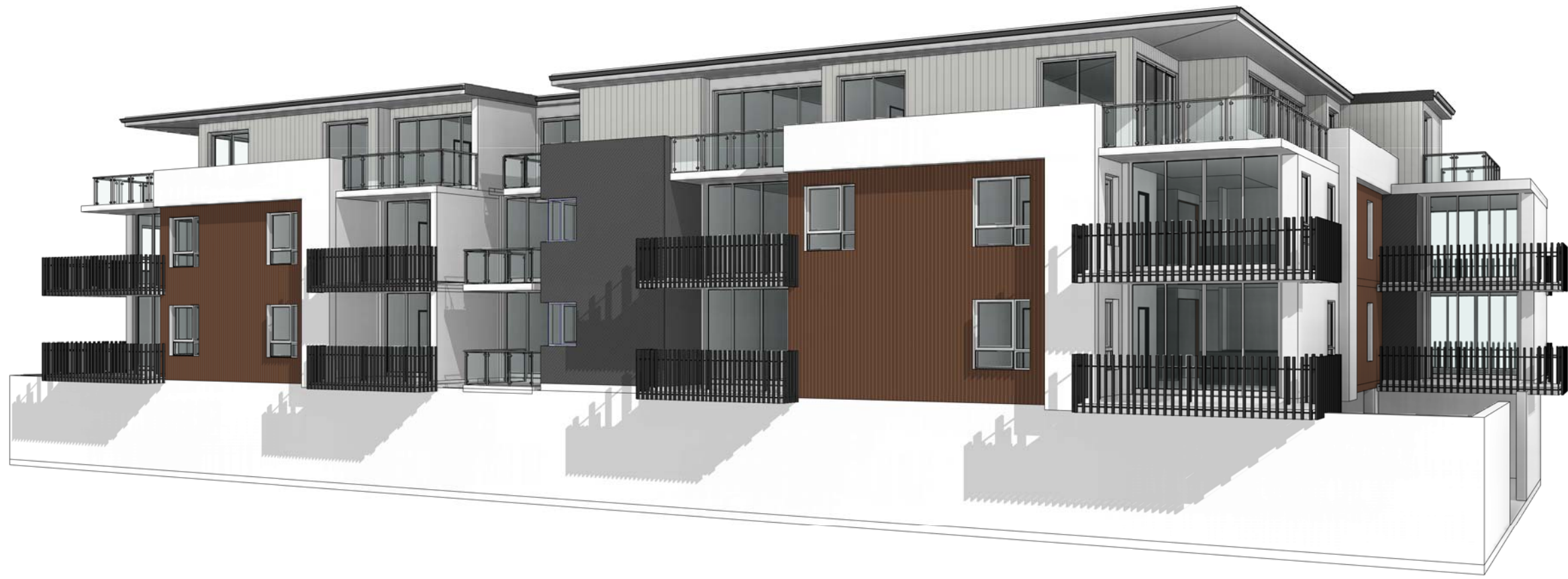
1 3D View 1