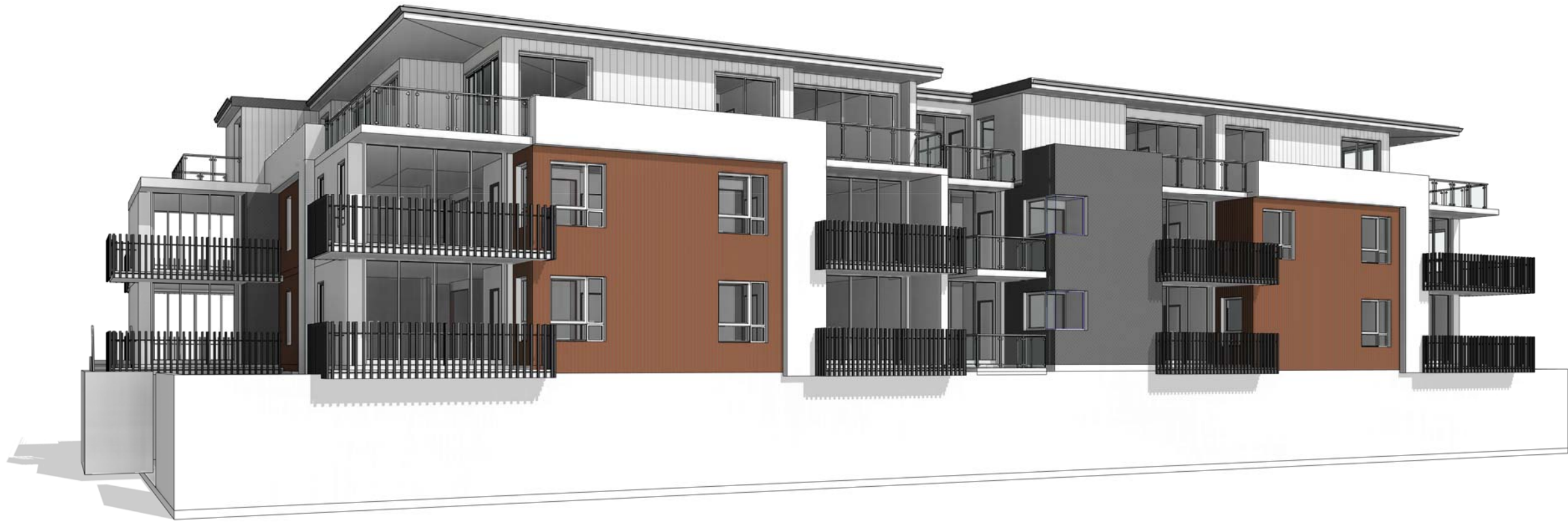
2 3D View 2